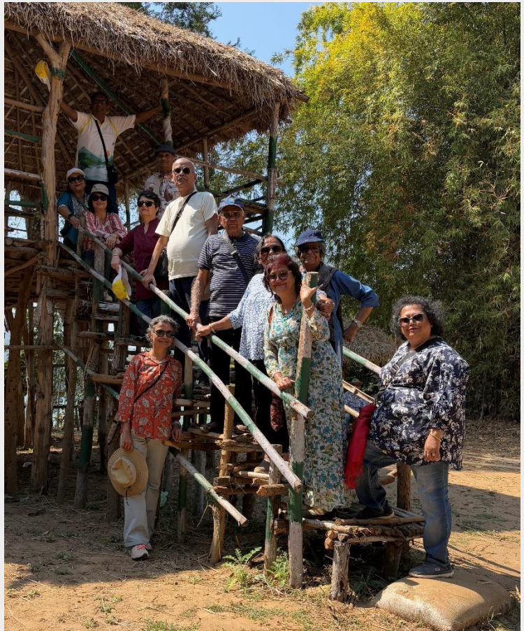
Annual Family trip to Satkosia, Odisha, Feb'25

PEACE AND CONFLICT PREVENTION/ RESOLUTION